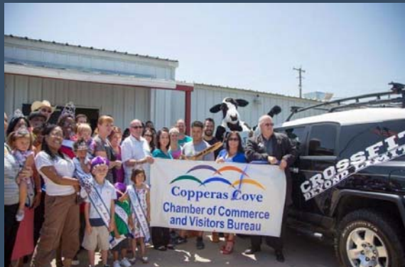
Crossfit Beyond Limits