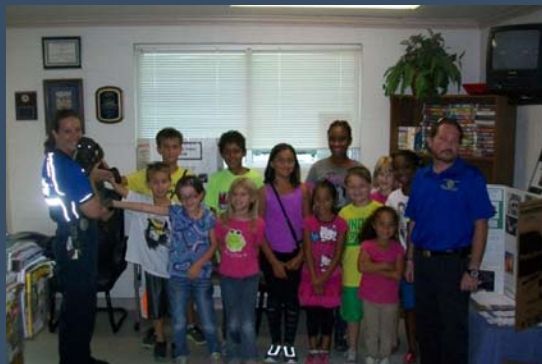
Boys & Girls Club visited on July 30th

The shelter also hosted FREE Adoption Events in July, August and September with outstanding results. During these events the adoption fees for all adoptable dogs and cats are waived. An adoption agreement which requires the animals to be spayed/neutered, vaccinated and micro-chipped is still required. For more information on monthly FREE Adoption events please contact the shelter at (254)547-5584: