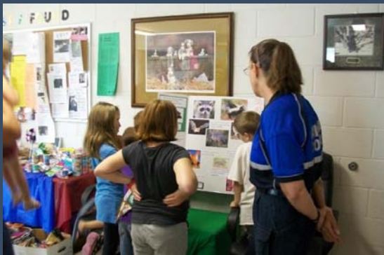
Girl Scout Troop #6127 visited on July 9th

The Animal Control Shelter kept busy during the quarter with a couple group tours in July, and a Pet Vaccination Clinic in August: