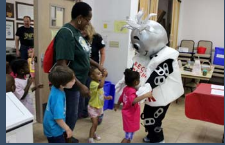
Right: Recycle Michael greets children for Superhero's Day at the Library in July.